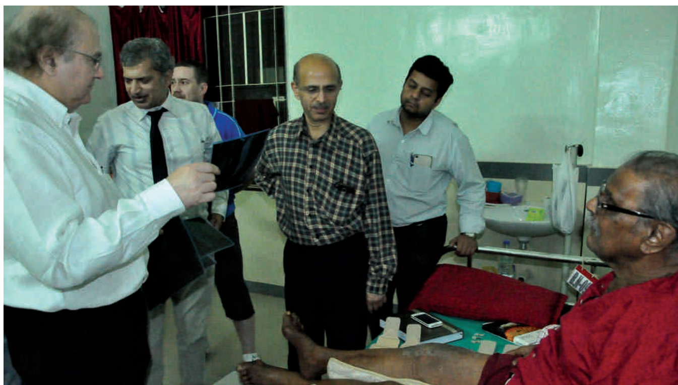
British Medicos on Pre operative ward rounds