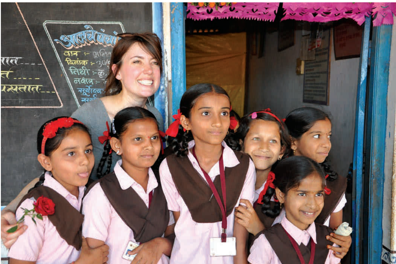
School Visit by UK Team at Kosumb (Tal. Samgmeshwar, Dist. Ratnagiri)