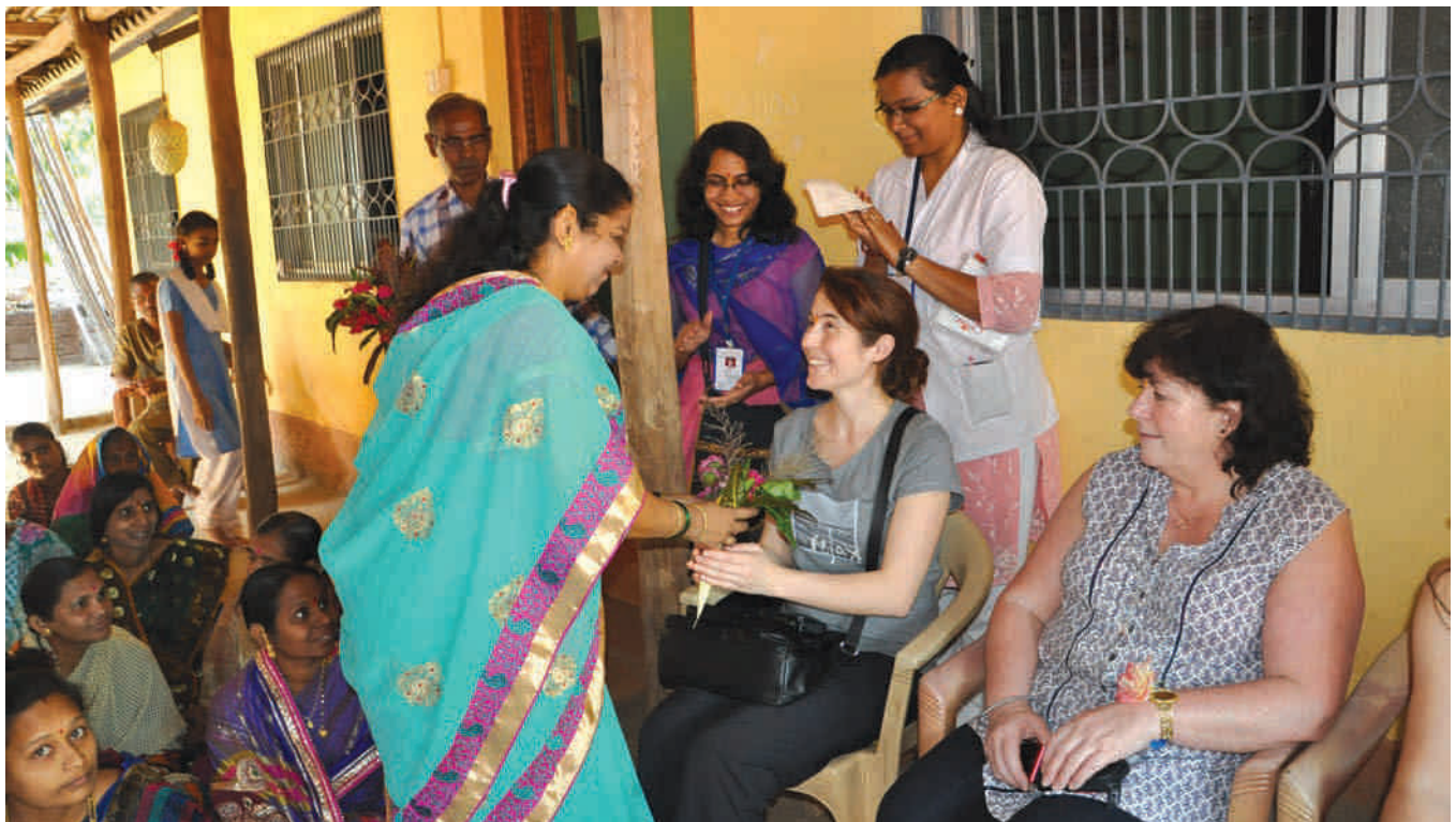
UK Team Visits 'Bachat Gat' in Kudap Village.