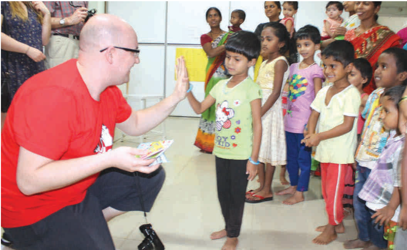
Compassionate hands, innocent minds