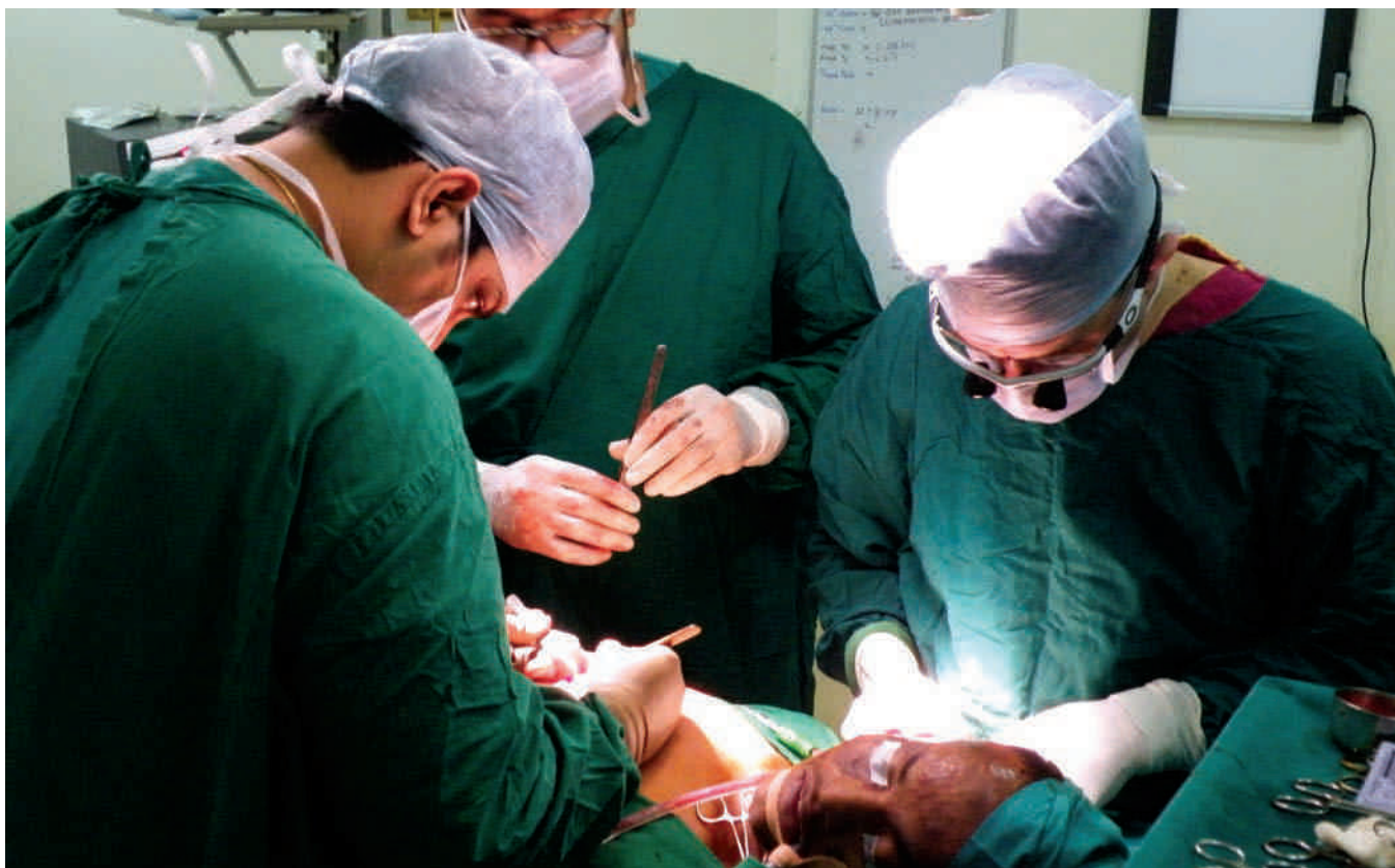
Plastic surgery team operating.