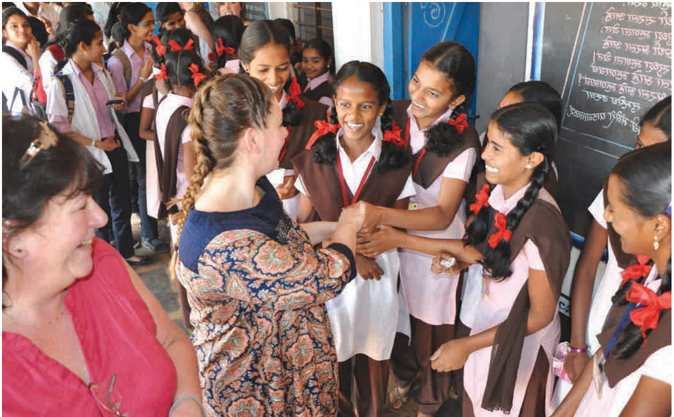
UK Team visit to Kosomb Village for adolescent girls awareness programme. (Tal. Sangmeshwar, Dist. Ratnagiri)