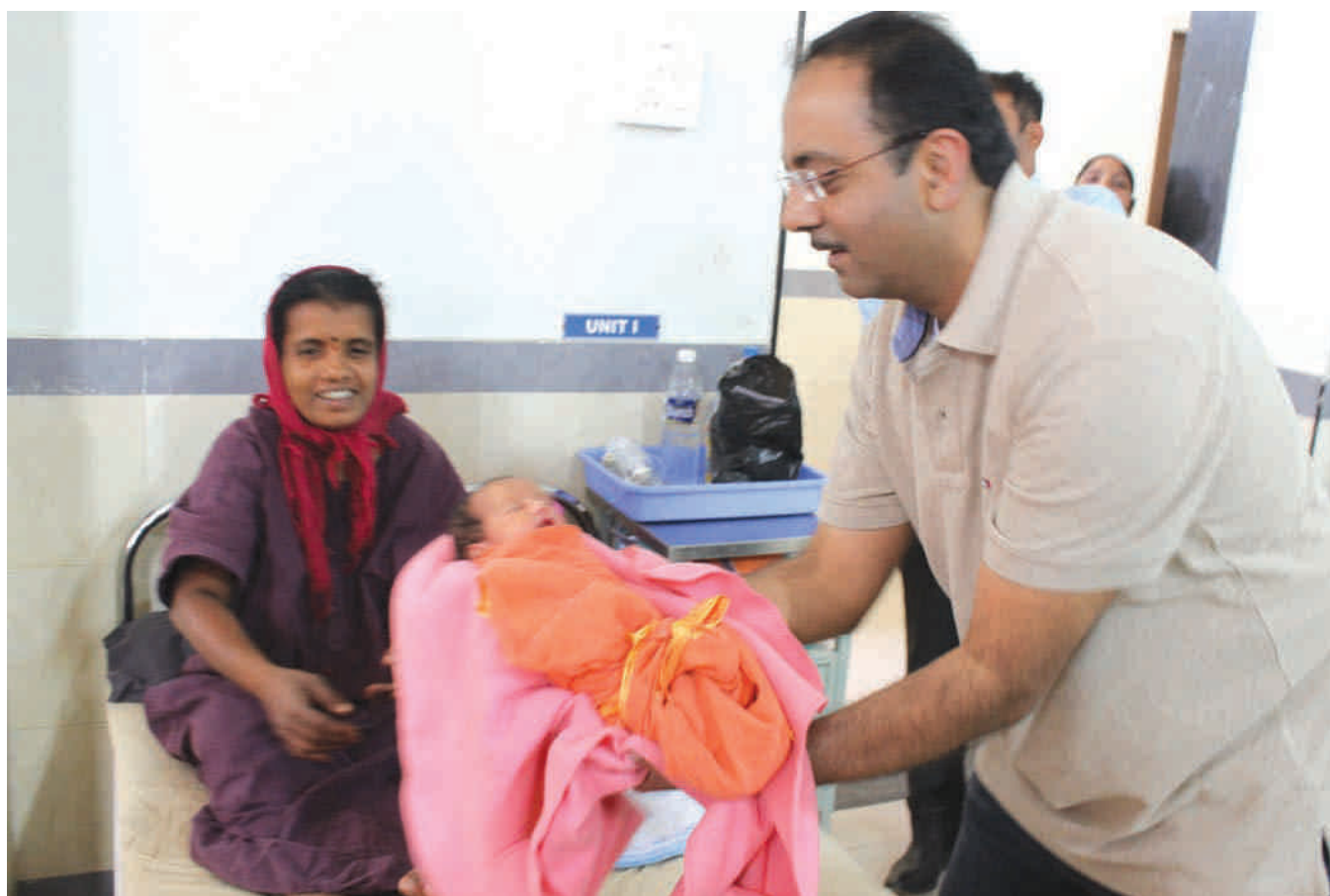
Upliftment of the poor !

you are not sure that you will get quality treatment, for the money which you paid. In dervan all patients were very much satisfied and they get excellent quality of treatment for what they paid. They get exactly what they required. From the options of surgeries exact required surgery for the patient were performed. It was not the doctor decided according to his skill and excellency in operative skill.