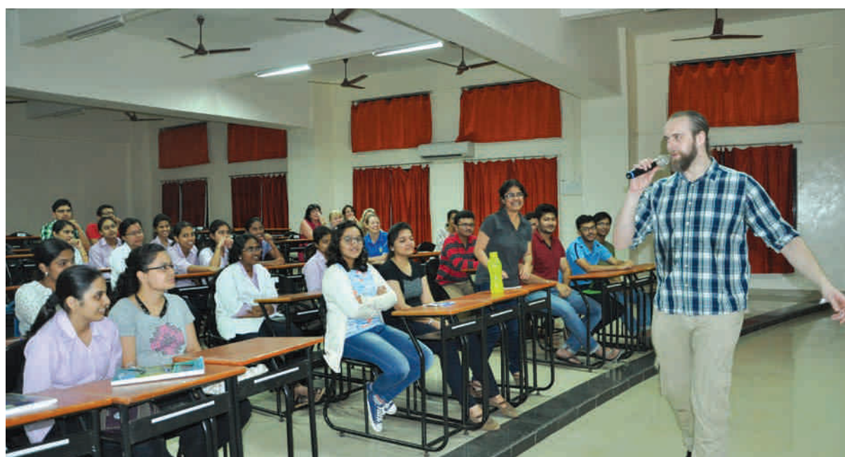
John wall interaction with Students