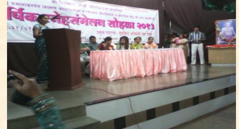
Conference hall - A spacious hall is available, for meetings, conferences, Presentations, Guest lectures, Seminars etc. Recreation hall -Well furnished & spacious recreation hall is available for cultural activities & various functions.