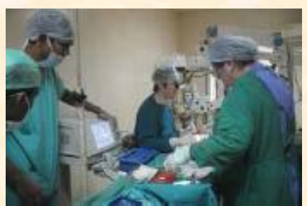
GENERAL OPERATION THEATRE- 5 full fledge, well equipped operation theatres available for major & minor surgeries. EYE HOSPITAL AND OPHTHALMOLOGY OPERATION THEATRE – A special unit of eye care hospital and operation theatre for eye surgeries is available in the campus.