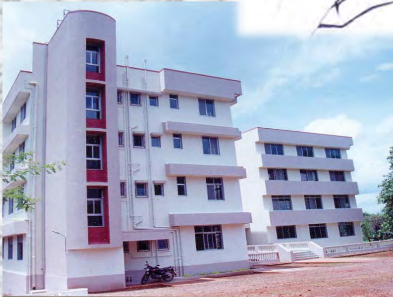
COLLEGE OF ADVANCED STUDIES