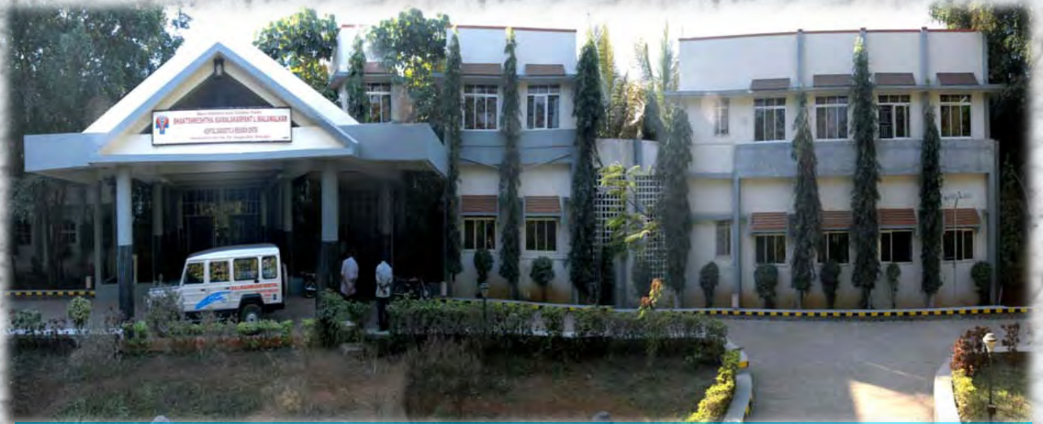
BHAKTHASHRESHTHA KAMLAKARPANT LAXMAN WALAWALKAR HOSPITAL AND RURAL MEDICAL COLLEGE

TALUKA - CHIPLUN, DISTRICT - RATNAGIRI, MAHARASHTRA - 415606