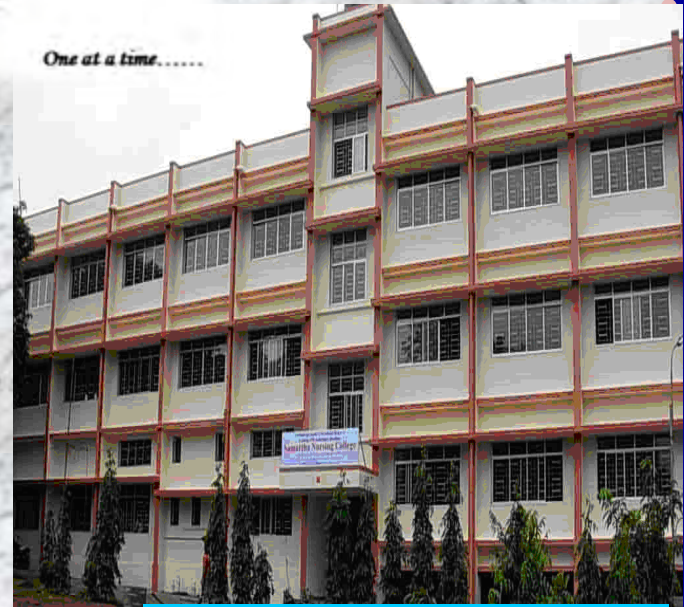
SAMARTHA INSTITUTE OF NURSING EDUCATION

At-Shreekshehra Dervan, Kasarwadi, Sawarde, Tal.-Chiplun, Dist.-Ratnagiri. Pin - 415606.