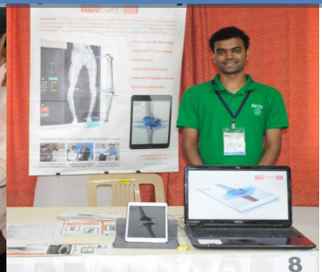
TAB-PLAN: A surgery planning software in 3D by IIT Bombay