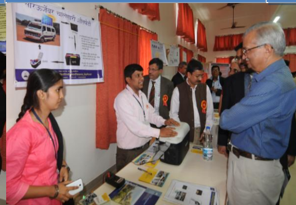
Portable Solar fridge by VPM's Maharshi Pashuram College of Engineering, Velneswar