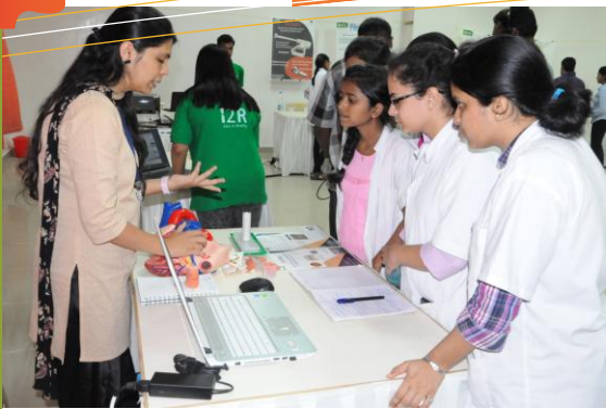
A template to cut Pericardium during Aortic Valve replacement Surgery by IIT Bombay