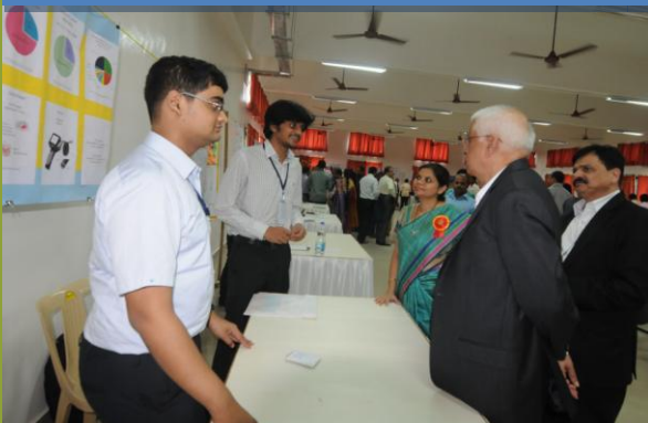
CER-SCAN: A portable device for early detection of Cervical & other cancers by Venture Center Pune.