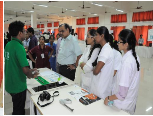
X-Hand: Ergonomic Laparoscopic handle by IIT Bombay