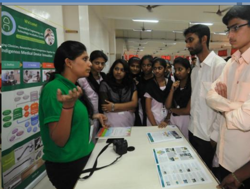
Indigenous Medical Device Innovation at BETic, IIT Bombay