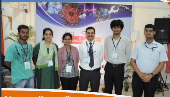
Venture Center Pune