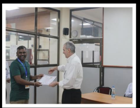
Participant's Certificate Distribution