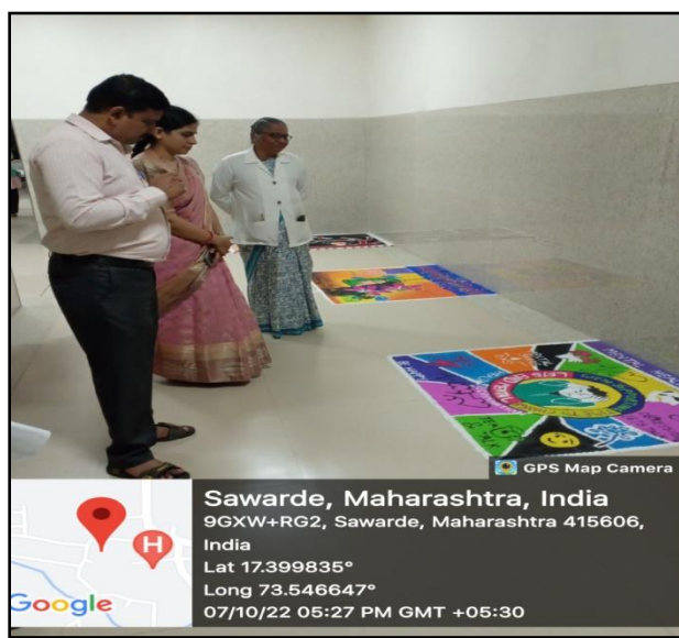
Rangoli competition 07/10/2022