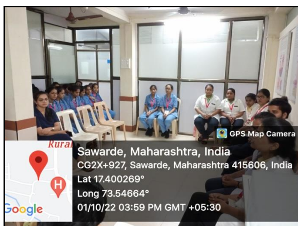
Quiz competition 01/10/2022