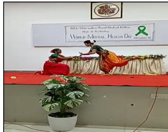
Classical dance performance