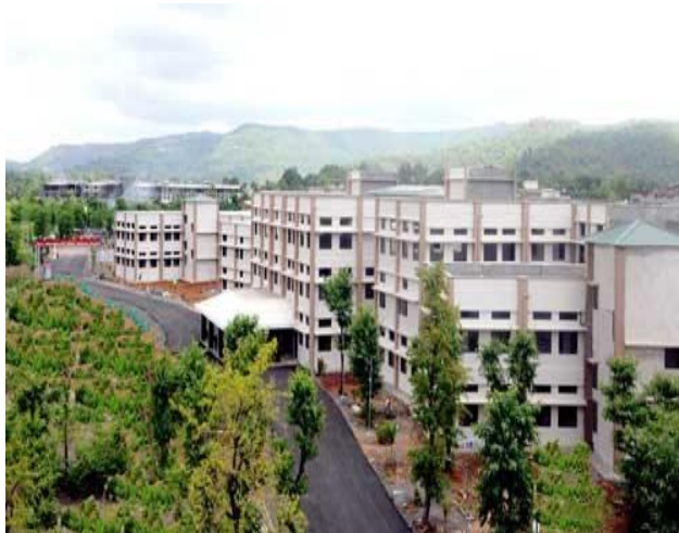
RURAL MEDICAL COLLEGE