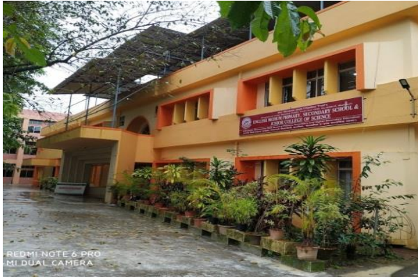
SVJCT 'S ENGLISH SCHOOL