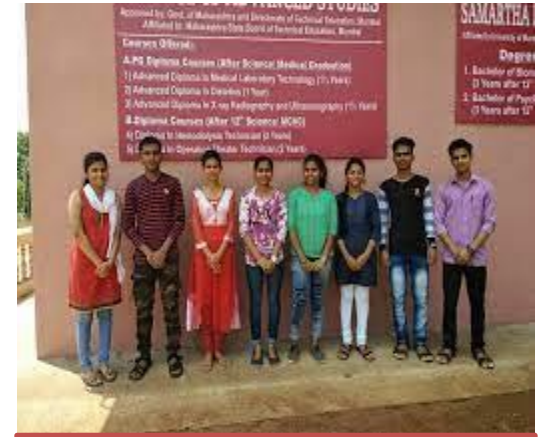
ADVANCE STUDY COLLEGE